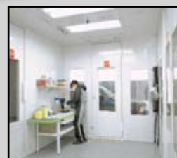
Ultra Mix Room

Call Today for more information on how the GFS Preventive