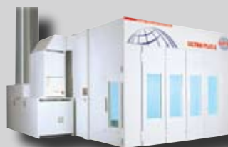
Ultra Plus 1

GFS Technicians can provide services to paint booths, prepstations and paint mix rooms.